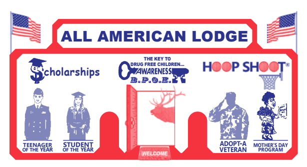
FLAG DAY —This event was created by the Elks, and it's an opportunity to teach members of your community about our ritual while promoting respect for the flag of our country.

MEMORIAL DAY —Elks are never forgotten, never forsaken. This annual ritual is an opportunity to memorialize beloved Brothers and Sisters who will come no more when their name is called.