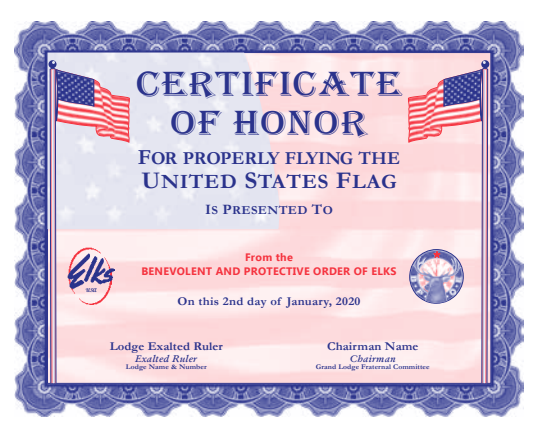
*Representation of certificate. Actual certificate can be found, filled in and printed out at: https://www.elks.org/ GrandLodge/fraternal/files/FlyTheFlagCertificate.pdf

For more information, contact your State Association or your Area Member of the Grand Lodge Fraternal Committee, posted at elks.org.